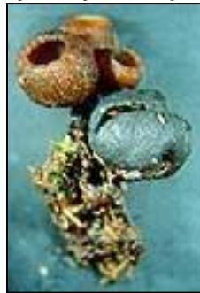
Mummy berry with apothecia

Developing buds become 'susceptible' when about 5 mm of green tissue is exposed in vegetative buds and when bud scales are separating in flower buds (F2 stage).