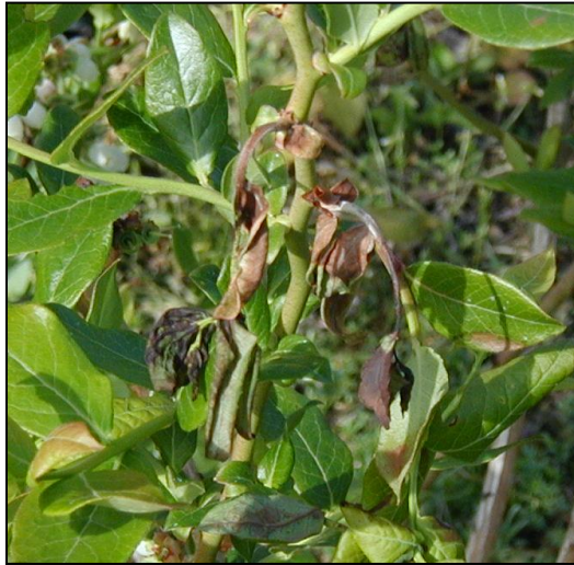
Typical leaf blight and wilt symptoms

Several weeks before harvest, infected fruit shrivel, harden, and turn salmon in colour. They will eventually fall to the ground where they renew the life cycle for future infections.