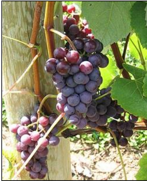
New York Muscat