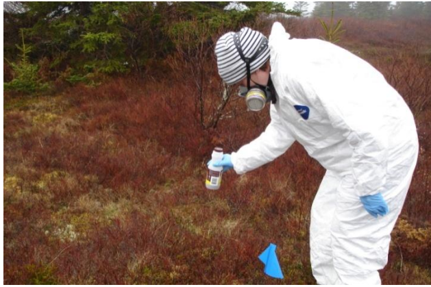
Figure 4: Applying Herbicide at Walsh Site