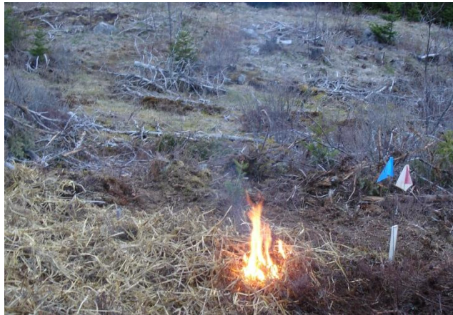
Figure 2: Applying Burn Treatment at Sangster's