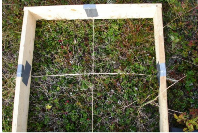
Figure 7: Mature Berries Ready to be Harvested