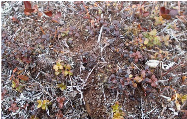
Figure 6: Winter damaged Foxberry Plants