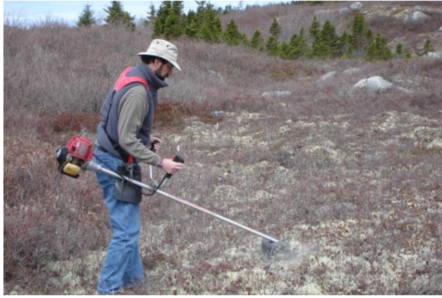
Figure 1: Applying Mow Treatment at Bull Hill