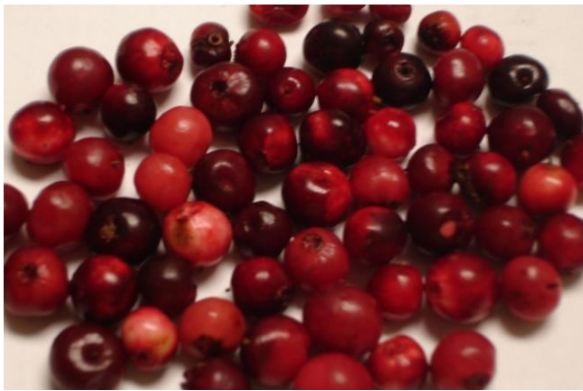
Figure 8: Harvested Foxberries