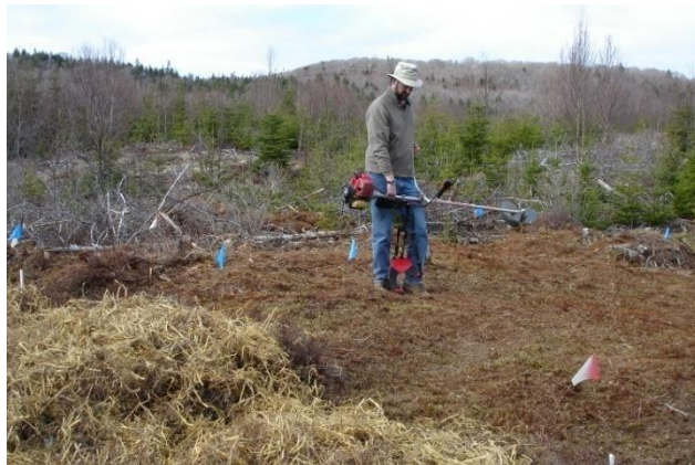
Figure 3: Sangster's Burn and Mow Plots